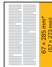
D1: 1/3 – bleed