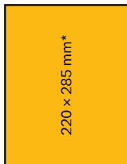
A: 1/1 – bleed