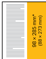
B1: 1/2 – bleed