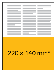
B2: 1/2 – bleed